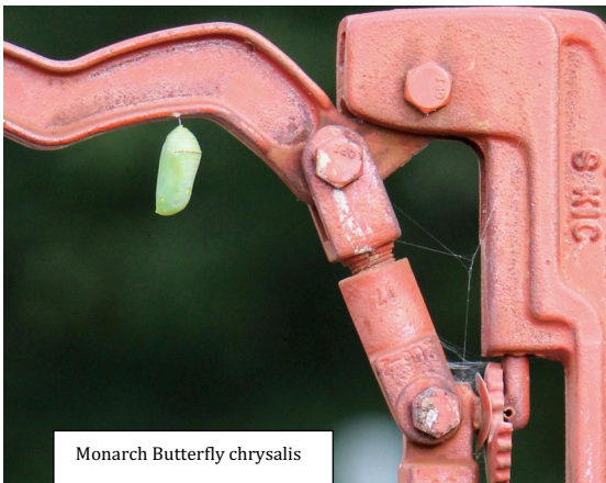
Monarch Butterfly chrysalis