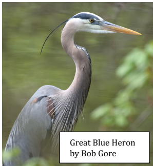
Great Blue Heron by Bob Gore

BIRDS There are so many birds in Ivy Creek, all sizes, shapes, and colors. All birds have feathers, wings, two feet, beaks, and they lay eggs. There are some birds that have wings but don't fly. All the birds here at Ivy Creek fly. And they have so many different colors: black, brown, red, yellow, blue, orange, green, or different combinations of all these colors. Look for bluebirds, cardinals, swallows, ducks, herons, and even owls! Good places to see birds at Ivy Creek are at the bird feeders near the barn, in the reservoir, or in the air of course!