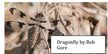
Dragonfly by Bob Gore

INSECTS There are lots and lots of insects here. Insects are usually small, have three body parts: head, thorax (middle part), and abdomen. They have six legs, two antennae, most have two pairs of wings, and they have their skeleton on the outside of their bodies! Some insects like butterflies, honeybees, praying mantises, and others help people. Some are nuisances like mosquitoes and roaches. Even the pesky ones are food for other animals so they serve a purpose and aren't all bad. You will find insects everywhere in the park.