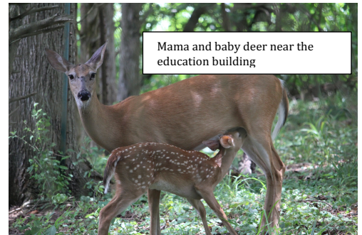
Mama and baby deer near the education building

Keep your eyes open to see mammals on any of the trails in the area. The easiest ones to see are squirrels and deer. Sometimes, if you're really lucky, you can see beavers in the creek or the occasional rabbit or chipmunk.