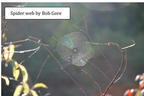
Spider web by Bob Gore

ARACHNIDS Sometimes it's difficult to tell this group apart from insects. But these animals have eight legs instead of six. Spiders and ticks are arachnids.